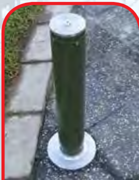
ROUND REMOVABLE BOLLARD GREEN